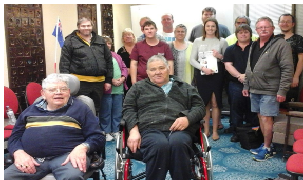
Wagga group and other community members at the Be Safe & Be Alert workshop.