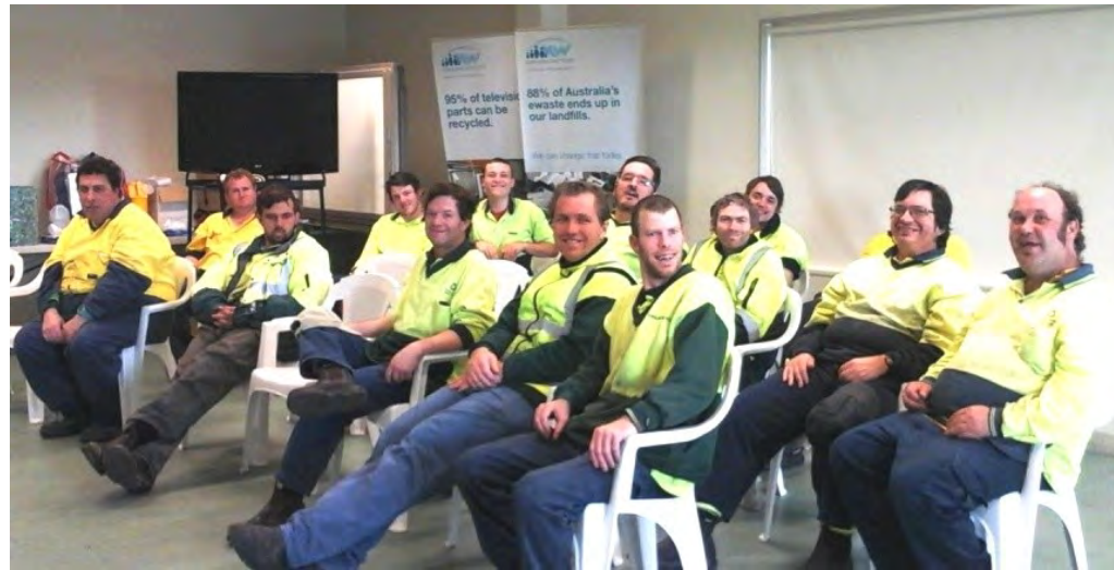
Confident group from Kurrajong Waratah Recycling at DAN's Standard 4 presentation.