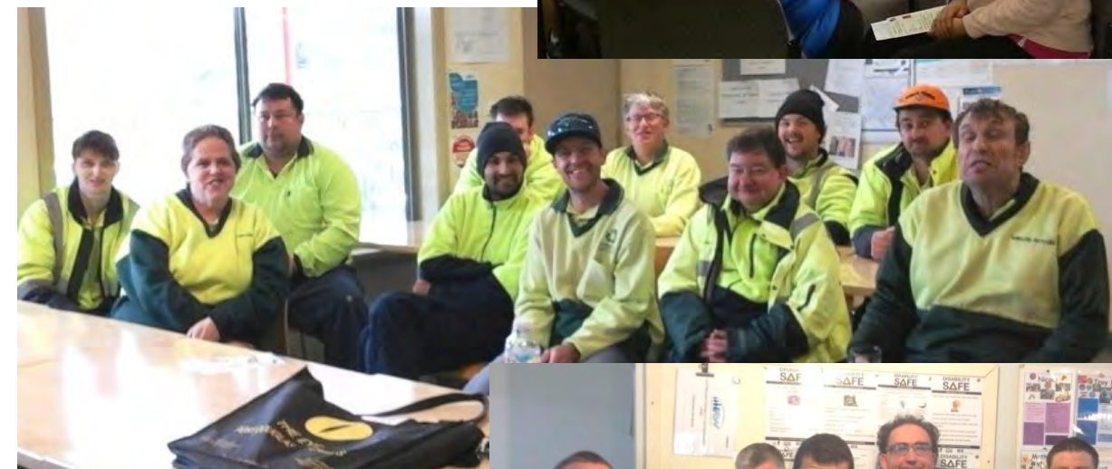
Happy participants from Kurrajong Waratah's E-Wates who put aside their work time to attend the "Standard 4" presentation.