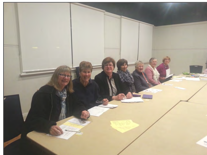
Inner Wheel Ladies from Leeton - enjoying an information packed presentation about DAN & Advocacy.