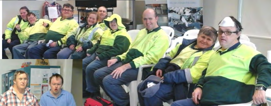
Satisfied participants who put aside their work time to attend the "Standard 4" presentation.