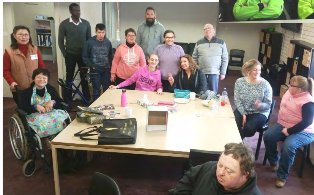
Creative group from Kurrajong Skills Option - at DAN's Standard 4 presentation.