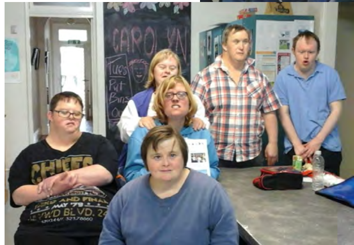
Friendly group from Kurrajong Waratah Skills Options at DAN's Standard 4 presentation.