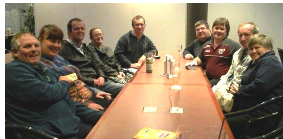
Some of DAN's Self Advocacy Support group members enjoying their social night out at the Rules Club.