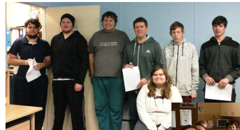
Taster Tour at DAN's office was enjoyed by the group from Job Centre Australia.