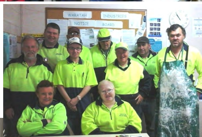
Assertive group from Kurrajong Waratah Industries at DAN's Standard 4 presentation.